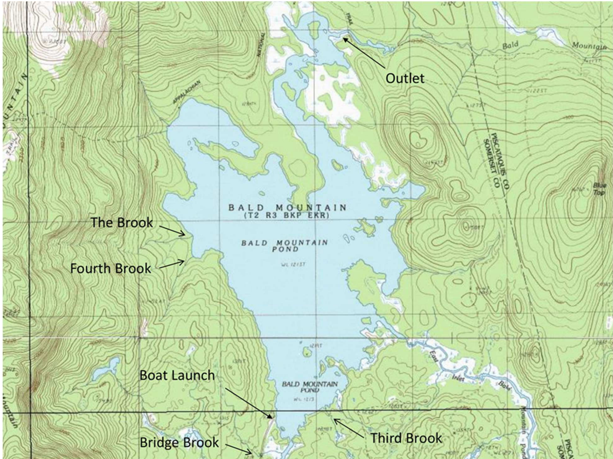
Figure 1. Map of Bald Mountain Pond, Somerset County.